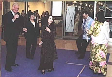
Crowd gathers to enjoy traditional Malaysian dances.