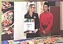
Participants at the exhibit opening look through information on Malaysia and its culture.